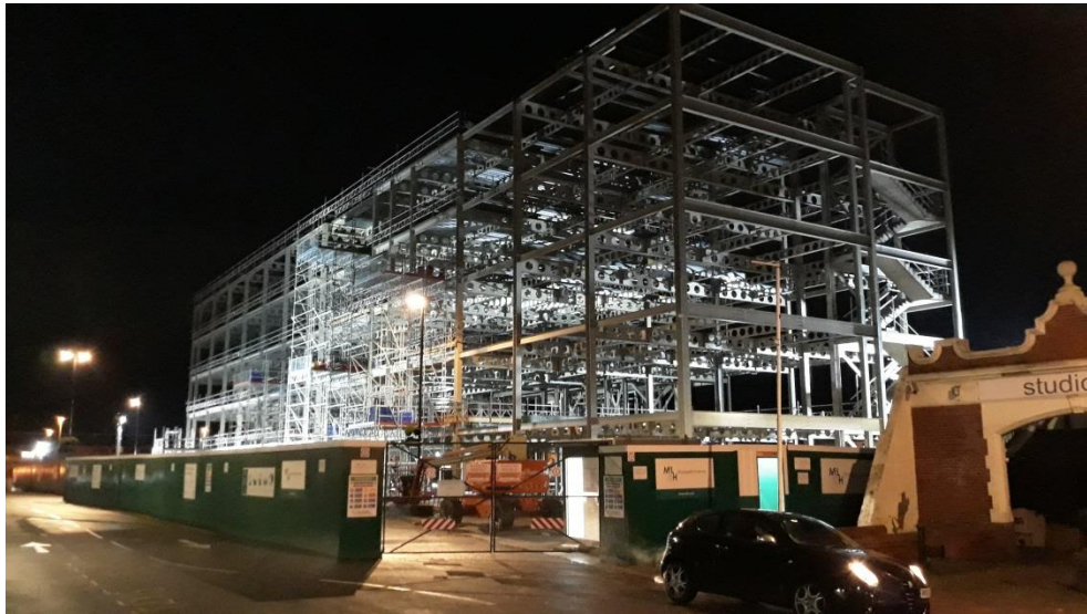
Teville Gate House Construction 12/12/2019