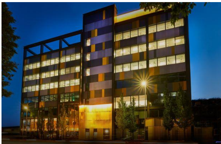
Plus X building